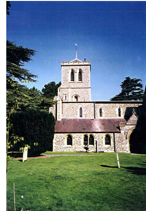
Site photo - South